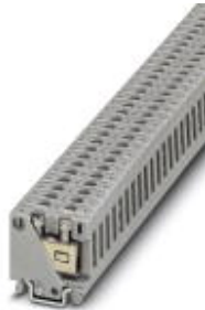
Feed-through terminal block, Connection method: Screw connection, Cross section: 0.2 mm 2 - 2.5 mm 2 , AWG 24 - 14, Width: 5.2 mm, Color: gray, Mounting type: NS 15

Please be informed that the data shown in this PDF Document is generated from our Online Catalog. Please find the complete data in the user's documentation. Our General Terms of Use for Downloads are valid ( http://download.phoenixcontact.com )