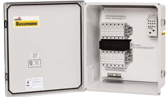
BCBS Series Standard Box