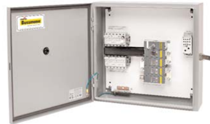
BCBD Series Integrated Disconnect Box