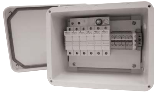
BCBC Series Compact Box