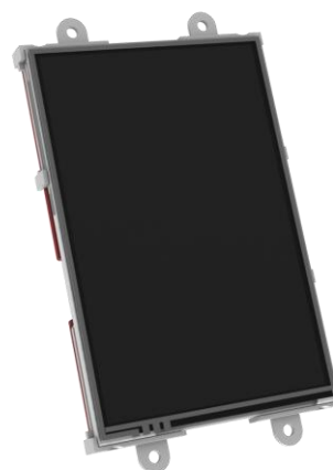
The uLCD-35DT Display Module