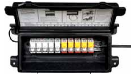
3M™ SLiC™ Stubbed Aerial Terminal with 3M™ Termination Module MX2000 unprotected/protected Terminal Block