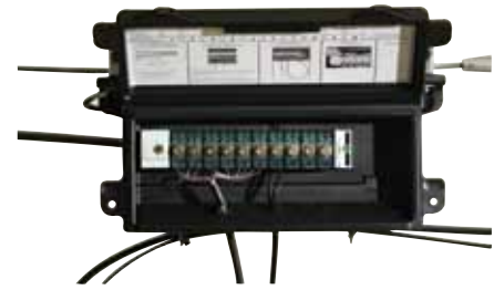
3M™ SLiC™ Stubbed Aerial Terminal with 3M™ Multi-Pair Terminating System ATS/TR termination block