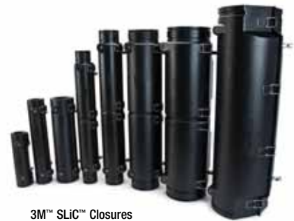
3M™ SLiC™ Closures

For the last 20 years, 3M SLiC closures and terminals have protected aerial networks, globally, in more than 30 different countries.