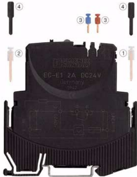
Figure 5 Structure (using example of EC-E1)