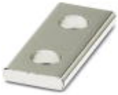
Connection rail, Color: silver