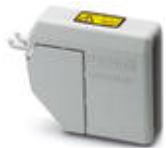
Covering hood, Width: 28.8 mm, Height: 59 mm, Color: gray