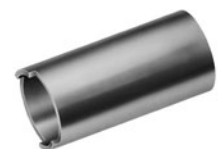
AT112 Socket Wrench