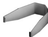
AT109 Cap Extractor

Actuator must be in UP position. Pull off cap with cap extractor AT109. Replace lamp and reassemble as shown above.