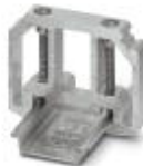
End clamp, for end support of UKH 50 to UKH 240, is pushed onto DIN rail NS 35 and fixed with 2 screws, width: 10 mm, color: aluminum