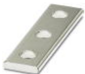
Connection rail, Color: silver