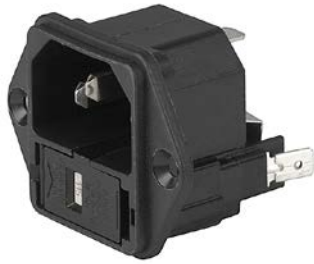
Order required accessories separately