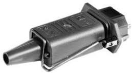
Cord retaining kits Cord retaining strain relief