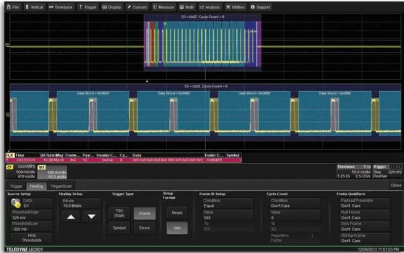
Trigger on every aspect of the FlexRay Frame as well as Symbols and Errors including FSS, BSS, FES, CRC, CID, CAS/MTS and Wakeup by selecting the appropriate boxes.

Triggering on the complex FlexRay protocol is made easy with an intuitive interface and a wide range of trigger settings for all aspects of the protocol. Set up a simple TSS (Start) symbol trigger with a single button press or trigger on any part of a FlexRay frame including ID, Cycle Count, Cycle Repetition Factor and Frame Qualifier. FlexRay defined Symbols and Errors can also be incorporated into the trigger making it as simple or advanced as necessary. Conditional triggering can be set to trigger on a range of Frame IDs or Cycles.