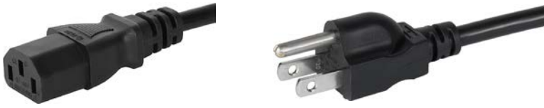
Power plug Japan black