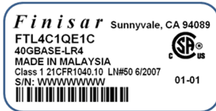
Figure 3 – FTL4C1QE1C production label