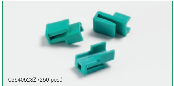
Terminal Lok Type 5