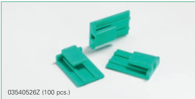
Terminal Lok Type 3