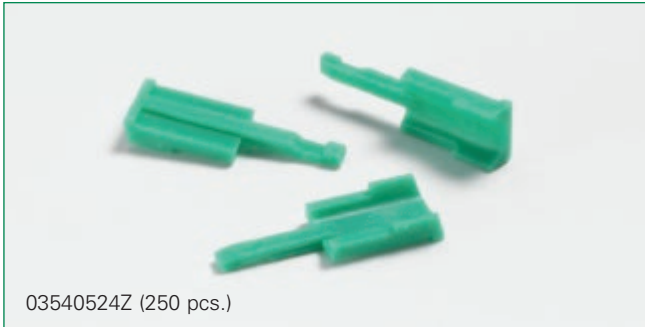
Terminal Lok Type 1