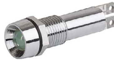
Housing chrome LED green Chalice shape with internal reflector