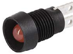
Housing black dull LED red Chalice shape with internal reflector